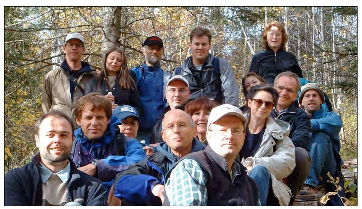
Participants in the weekend writing workshop at Waskesiu during one of their hiking breaks.