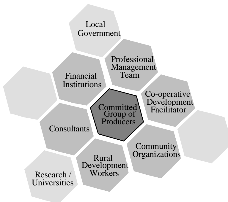
Figure 3: Critical Elements in the Growth of New Generation Co-operatives (Stefanson et al. 1995)

The NGC model offers direct benefits to the producers who own these ventures. Because NGC development is similar to community economic development, however, many benefits also accrue to the community in which the venture is located and to the various rural communities from which the members come. These benefits include enhanced local decision-