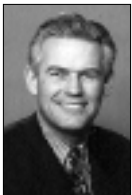
Fraser Nicholson Govt of Sask